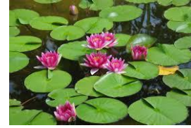
The Lily Pond

The fog has lingered all night long, And hidden the water from view; Now lifts with the first days of morning sun, As a spectre in a sluice. At last unveiled is the lily pond With its pads and posies galore! I watch the lilies open to the sun As I try to reach them from shore- And hear the croak of the nervous frog, Who seems to say, "No More?"